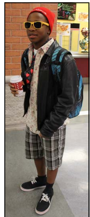
More Fashion Disasters on the next page