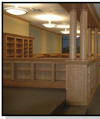
The new King's library – awaiting books and volunteers.