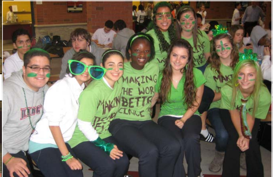
OUR GREEN GRADE 11s: MAKING THE WORLD A BETTER PLACE SINCE 1994.