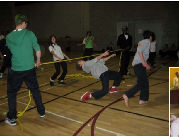
Do the Limbo!!