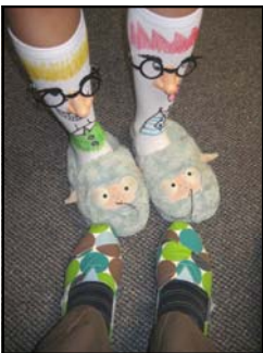
FUN FOOTWEAR DAY allowed us all to enjoy some silliness. Dylan Agnew and Chelsey Pollari (right) display their Grade 9 Fashion Footwear style.