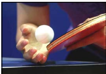
TABLE TENNIS, ANYONE?