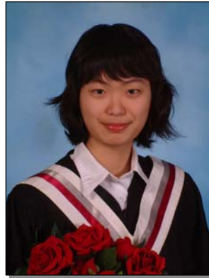
HA NEE PARK

CONGRATULATIONS TO THESE TWO FINE SCHOLARS!