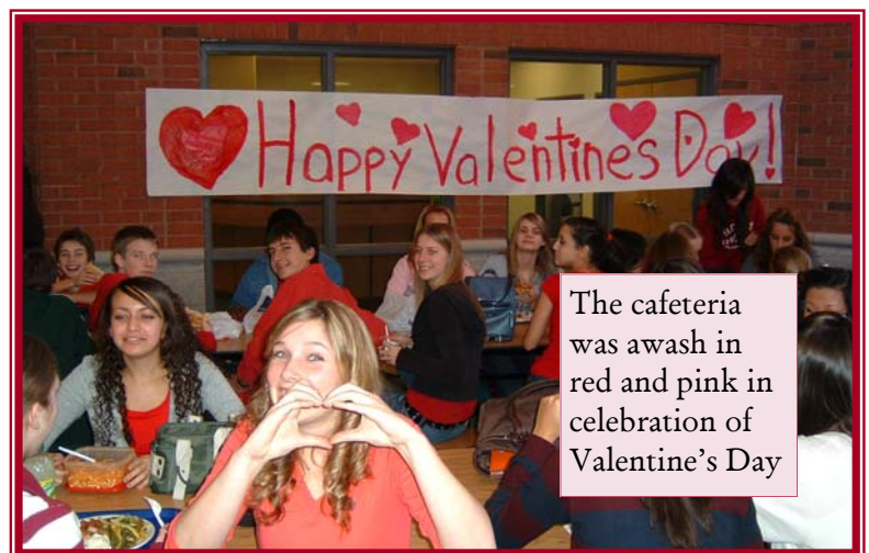
The cafeteria was awash in red and pink in celebration of Valentine's Day